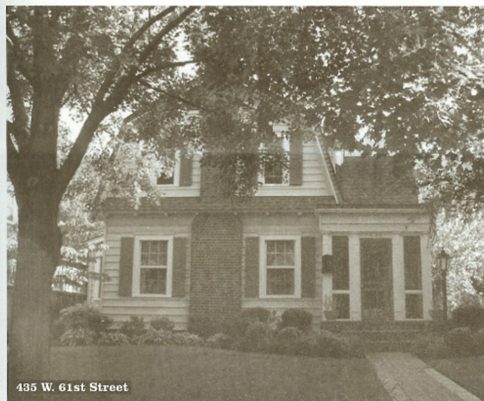
435 W. 61st Street