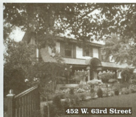
452 W. 63rd Street

HOMES ASSOCIATION NEWS • KANSAS CITY, MO 64113 • SEPTEMBER 2006